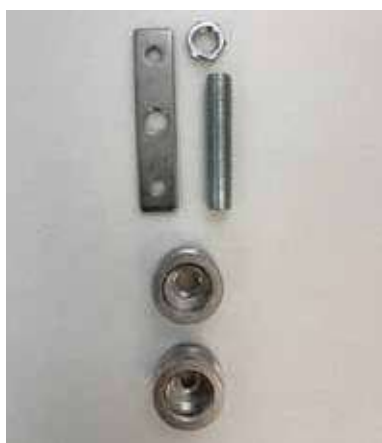
1/ Components to use for: standard behind wall/behind tile installation (heated)