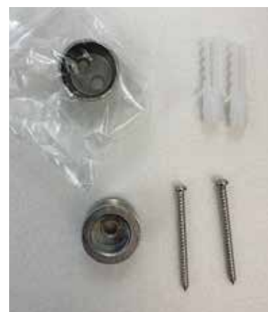
3/ Components to use for: installing VTR heated but haven't installed the behind wall/tiles fixing (i.e. if you just have a small hole in the tiles with the wire coming through) NOTE this should be used as LAST RESORT if behind wall/ tile fixing has been missed