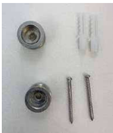
2/ Components to use for: installing the VTR non heated